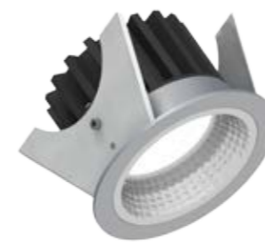
Luci Series Silver 75 fixed