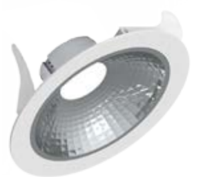
Luci Series Silver Shop 185