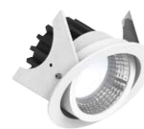
Luci Series Silver 90 directional