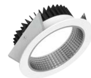
Luci Series Silver 185 fixed